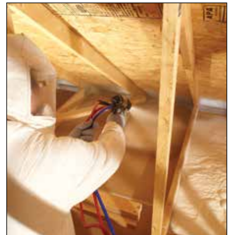
Spray - Ideal for attics and rim joists.