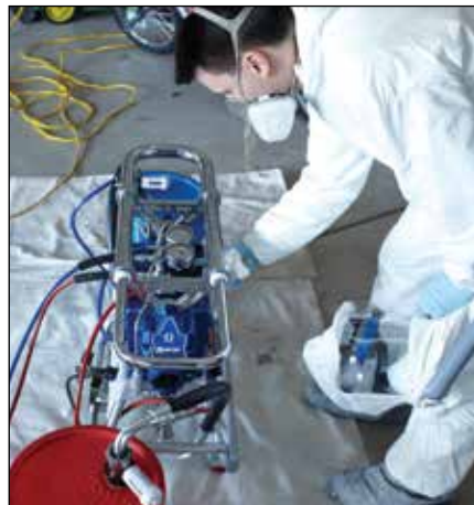
Set - Get ready to spray in a matter of minutes.