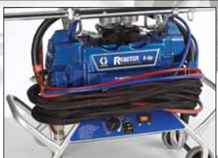
Carrying Handle/Hose Wrap Easy to transport, convenient hose storage.

Easy to maneuver – 70% lighter than standard Reactor heated hose