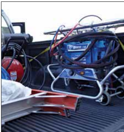
Ready - Easy to transport to the job site.

* Per The Dow Chemical Company for Froth Kits: The theoretical yield has become an industry standard for identifying certain sizes of two-component kits. Theoretical yield calculations are done in perfect laboratory conditions, without taking into account the loss of blowing agent or the variation in application methods and types. This chart is an example only and should be reviewed for each application. Dollar savings are not guaranteed. Actual results may vary.